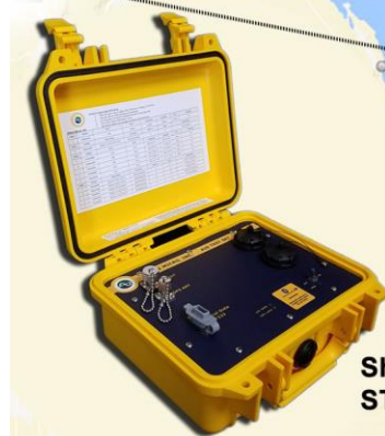
Shine Micro ST162 AIS Test Set