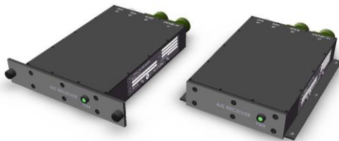
Type 1 Dzus Rail Mount* Flange Mount