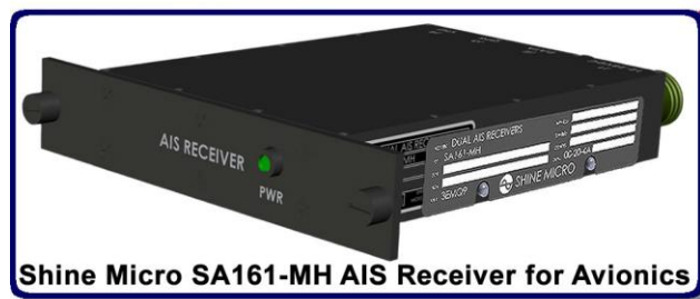
Shine Micro SA161-MH AIS Receiver for Avionics

The SA161-MH and ST162-T1 are COTS equipment and standard options on Lockheed Martin/Sikorsky MH-60 Helicopters, Lockheed Martin P3 and Boeing P8 aircraft, Insitu Integrator™ UAS, and many others.